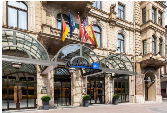
Radisson Blu Beke Hotel

Address: Budapest, Teréz krt. 43, 1067 Hungary