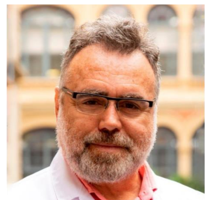
Eduard Vieta (Spain)